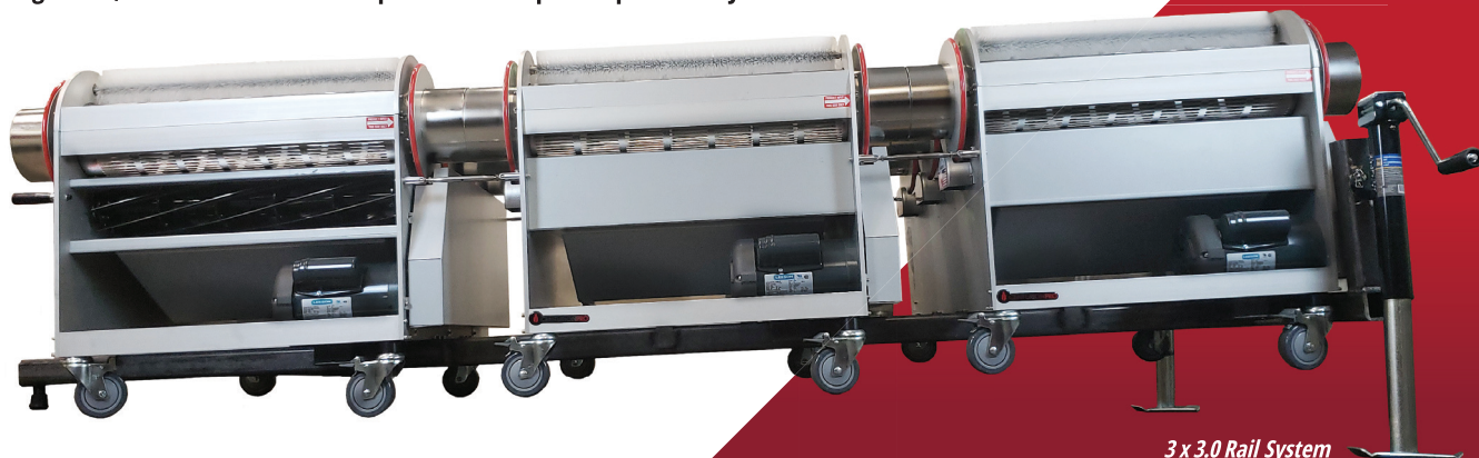
3 x 3.0 Rail System